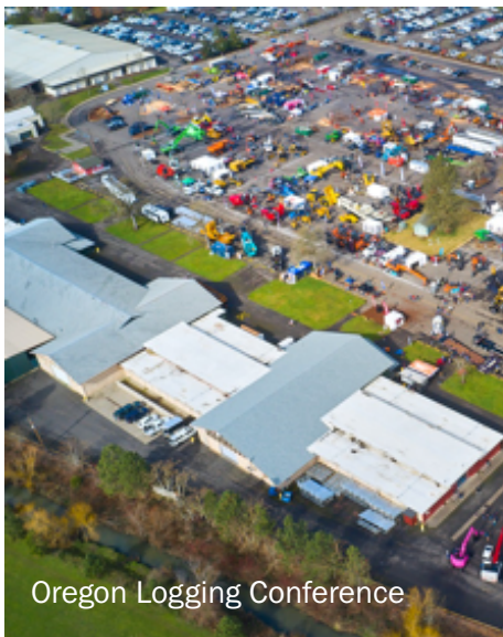
Oregon Logging Conference

& Washington). Her Address will cover recent U.S. Forest Service changes affecting logging, noting that new USFS goals to boost harvests and reduce fuel loads support the OLC theme of Responsible Forestry Today, Healthy Forests Tomorrow.