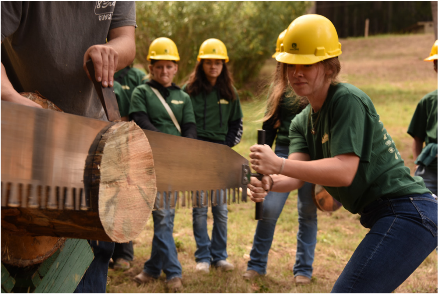
Above: A student from Venture Academy tries her hand on double buck saw at the Santa Cruz Forestry Challenge, October 11 to 14.